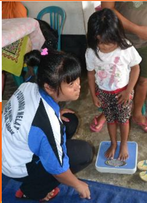
One of Integrated Health Center activity