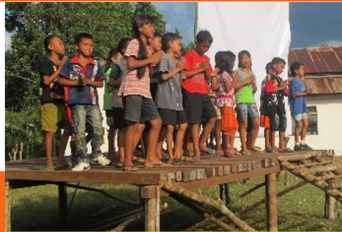
Pawis Hilir Children sang their local song