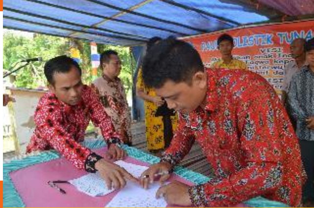
The Village Leader sign the Child Friendly Village Agreement