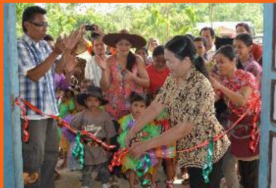
The inauguration of ECCE building