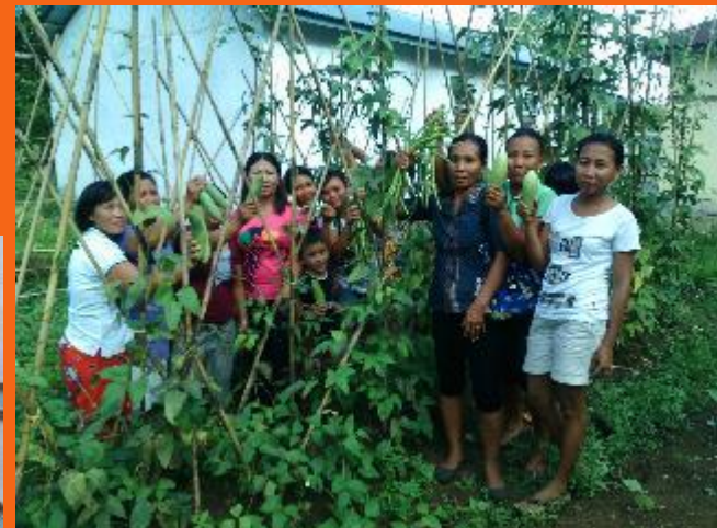
Pawis Hilir Nutrition Garden