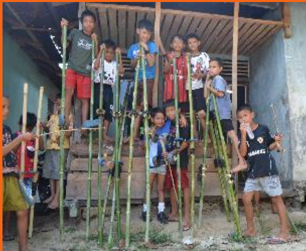
Pawis Hilir Children with their local game