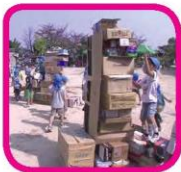
Play Makes Us Human (Japan)