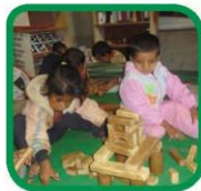
Educate the Future (Nepal)