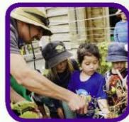
Te Puna Reo o Nga Kakano (New Zealand)