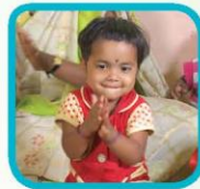
Opportunity and Freedom to Learn (India)