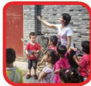
Sihuan Playgroup (China)