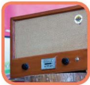
Broadclass Listen to Learn (Pakistan)