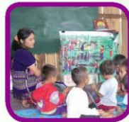
Our Language and Way of Life: How Young Children Learn at the Mae Tien ECD Centre (Thailand)