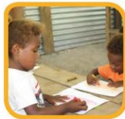
A Play-based School Approach (Solomon Islands)