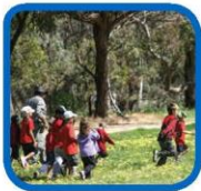
Djarigarra Bush School: On-Country Learning (Australia)

Innovative Pedagogical Approaches from: Australia, China, India, Japan, Nepal, New Zealand, Pakistan, the Solomon Islands and Thailand